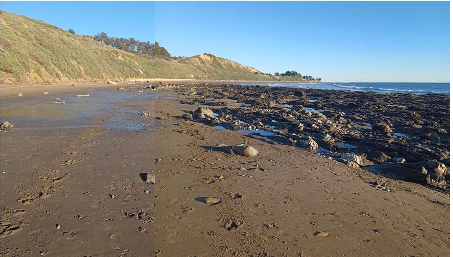
taken February 10, 2024, after the storm shows a field of exposed rocks before our sandy spot.