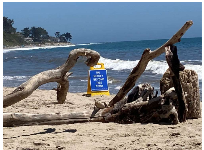
Greg's photo from the Saturday before the storm shows new driftwood deposited on the beach.

So to our members and other visitors, we recommend you look at the tide tables and plan any visits accordingly. Also, note the water temperature is a balmy 59 degrees this time of year!