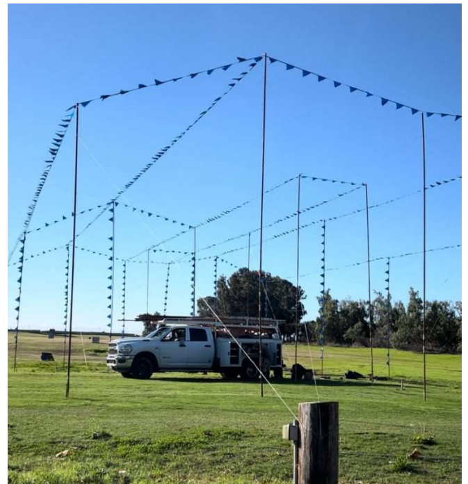
Tentpoles on the property show the size and breadth of the proposed buildings.

Eventually, the project will be reviewed by the City Council and Coastal Commission both of whom must approve it before it can be built.