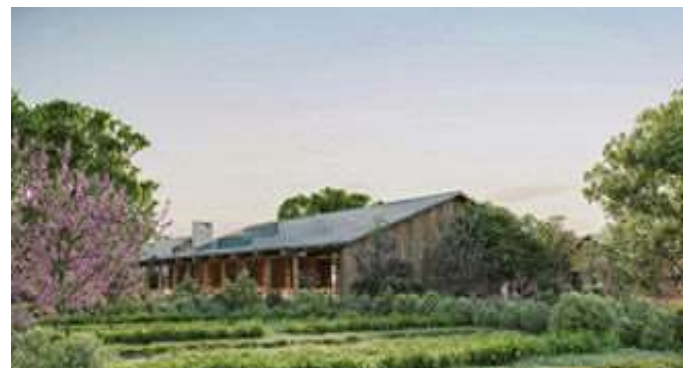
Proposed farmhouse-style restaurant on property.